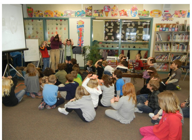
Gr. 2 & 2/3 Wild Voices Presentation