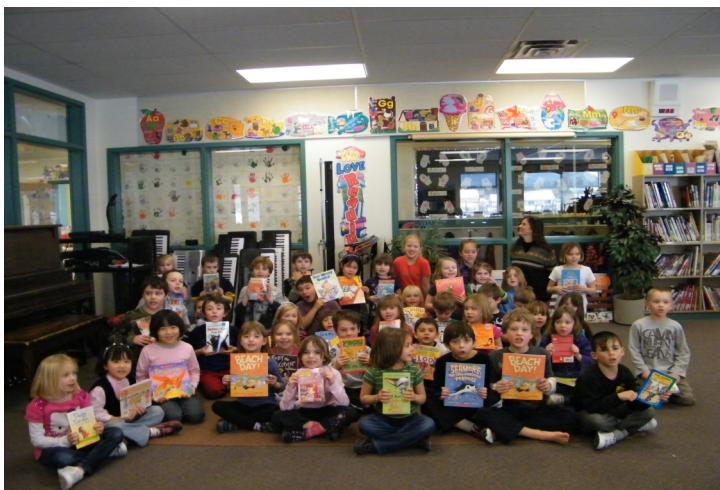
CBAL Battle of the Books