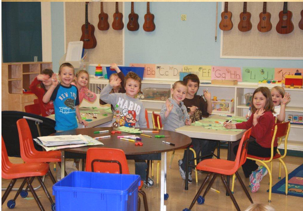
K/1 class working on Christmas Tree Mural