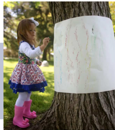
tree bark rubbings

https://www.icanteachmychild.com/outdoor-tree-bark-rubbings/